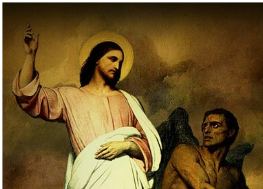
ON THE COVER: Temptation—Jesus and Satan